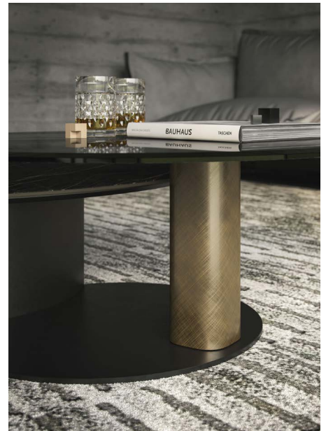
Arena Keramik Bond coffee table with Brushed Bronze base and matt Portoro ceramic top - Marek rug - Sting Brushed coffee tables - Fulham bookcase

The latest addition to the Arena family of coffee tables, the ceramic-top version Arena Keramik Bond masterfully balances the finest finishes of the Cattelan Italia coffee table collection.