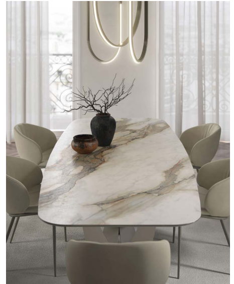
Skorpio Keramik table with pearl base and Borghini Calacatta ceramic top - Miranda ML chairs - Nahun lamps - KIMI rug

The star of our collection, the iconic Skorpio Keramik table, will be introduced to HPMKT audience with the newest ceramic finish: Borghini Calacatta. Therefore, the Cattelan Italia Keramik collection expands to a total of 14 variants, each with its own precise aesthetic code and character.