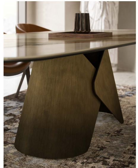
Scott Keramik table with Oxybrass base and Borghini Calacatta ceramic top - Miranda Wood chairs - Planeta lamp - Radja rug - Nautilus bookcase

With the launch of the new Scott family of tables, Cattelan Italia's exploration of sculptural art continues. With each new collection, the shapes and materials on offer increasingly emphasise the artistic-decorative aspect of interior design. The new table bases, such as the Scott family, take inspiration from modern sculptural techniques and apply them to design. The design of Scott table needs to be contemplated, just like a work of art.