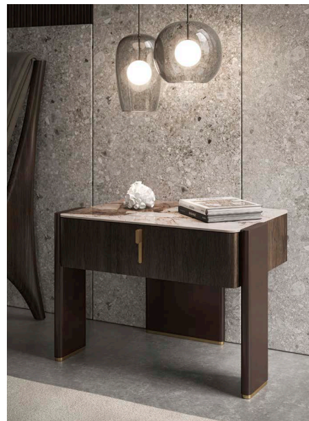
Julian with burned oak structure, bronze laquered wood legs and details in brass laquered steel, top in Corcovado ceramic. on the right: 1 drawer nightstand on the left: 3 drawers dresser

The set consisting of the Julian dresser and bedside tables allows you to daydream as soon as you cross the threshold of the sleeping area. They are a refined composition of materials in which wood and ceramic come together to create a unique and unforgettable design.