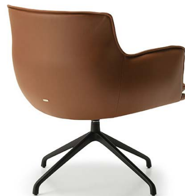
on the right: Rhonda Lounge A with black base and barrique Glove soft leather upholstery on the left: Rhonda Lounge B with graphite base and oyster soft leather upholstery

Since its debut in 2020, the family of chairs Rhonda collected worldwide appreciation. This year a major variant of this design model opens up to completely new possibilities : we introduce the Rhonda Lounge swiveling armchair .